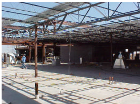
Interior view of Rangers clubhouse. Rough-in for HVAC system is underway and welding of metal decking.