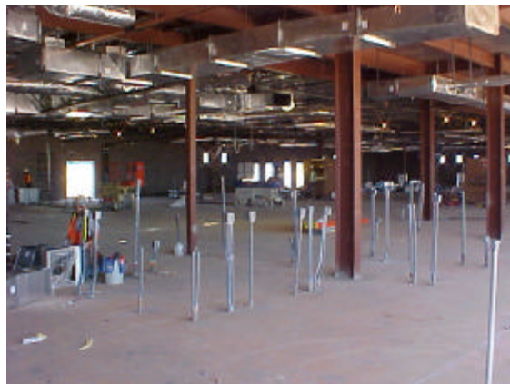
Interior view of Royals clubhouse under construction.