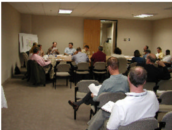
YAS Town Hall 4/18/02

As a follow up to the Youth & Amateur Sports Town Hall held on April 18, 2002, the Tourism and Sports Authority moved forward with the creation of a youth and amateur sports advisory committee, which held its first meeting on May 23 rd .