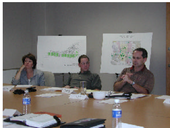
YAS Advisory Committee Meeting 5/23/02

At the May 23 rd meeting, the first order of business for the newly formed community-based advisory committee was to discuss the importance of the committee to the TSA in helping better understand the needs, desires, and most importantly, funding priorities of various youth and amateur sports stakeholder groups throughout Maricopa County.