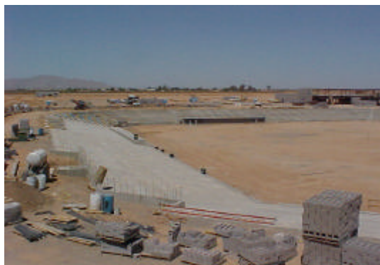
Seating bowl concrete has been completed.

City of Surprise – The two-team Cactus League facility that will be the new home of the Kansas City Royals and Texas Rangers is over 50% complete and will be ready for the 2003 Cactus League. Next month we will spotlight the tremendous progress that has been made at the site on the northwest corner of Bullard and Greenway Roads in Surprise.