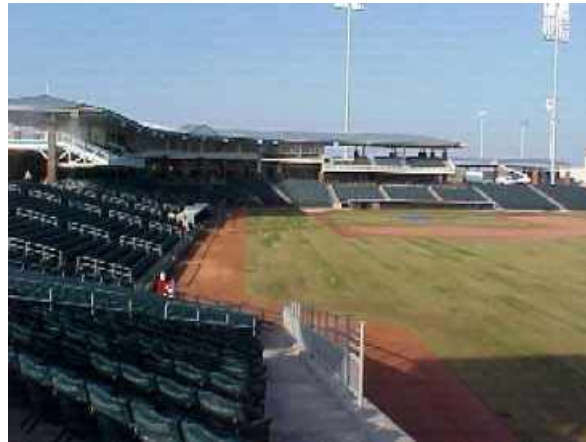
Overall view of the new Surprise Cactus League Stadium

The stadium is the new Spring Training home of the Kansas City Royals and the Texas Rangers, who are leaving Florida's Grapefruit League for the Cactus League.