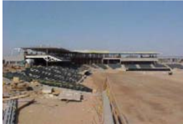
Overall view of stadium. Upper deck construction underway in press area and suites

focus of the work has been at the upper level of the stadium on the press box and suites. At the stadium bowl, seat and handrail installation is near completion. The pole mounted stadium lighting has been completed. Construction of the stadium playing field has started and sod installation is anticipated the first week of October.