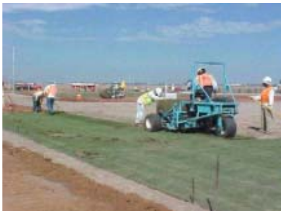
Crew placing sod at Royals minor league field.

The Royals Major League practice fields (3) are completed and their minor league fields were completed during the course of the month. Workers are currently completing the infill areas between fields as well as dugouts and other miscellaneous items.