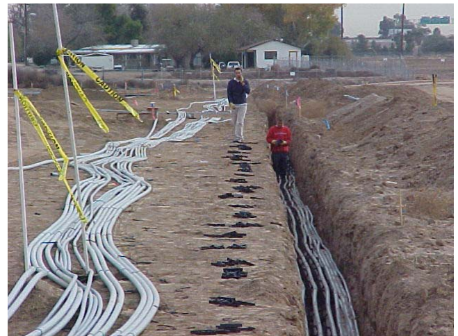
Workers installing duct bank for lighting & electric lines