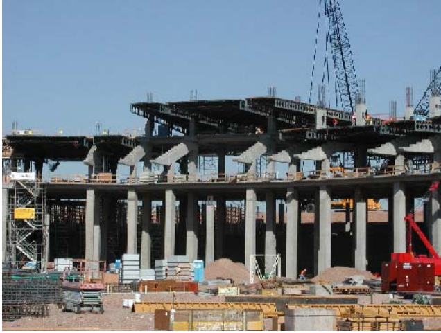
Forms for the Suite Level Begin on Top of Club Level Slab work.