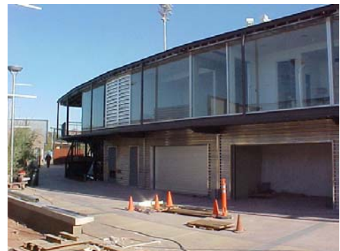
Concourse side of new press box at Phoenix Muni