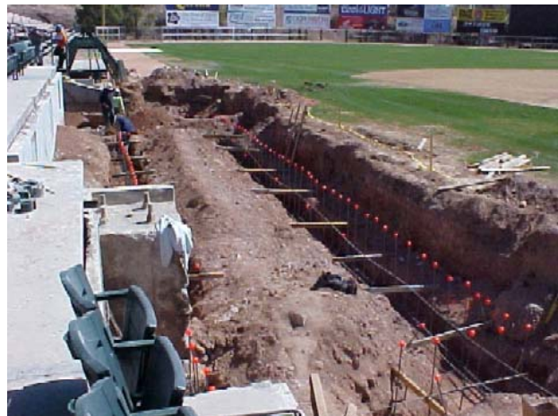
(Construction of footings at new dugouts underway)

On May 14, the Board of Directors approved the Intergovernmental Agreement that spells out the details of the partnership between the Authority and the City of Phoenix for a $6.4 million upgrade of Phoenix Municipal Stadium (of which $4.3 or two-thirds will be funded by the Authority). Based upon an earlier approval of a board resolution committing Authority funds, the work has already begun and is scheduled for completion by year's end, ahead of the 2004 Cactus League season.