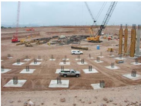
Northeast corner column footers at MPF – Glendale

Foundation activities started on Aug. 25 and the first foundation pour was made on Sept. 3. As of September 30 th , there have been 113 footings and 26 columns completed. The total amount of concrete placed to date for foundations, footings, and columns is 4,440 cubic yards. Concrete column activities were started on Sept. 8. The first column pour was made on Sept. 11.