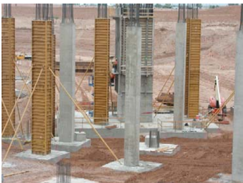
Northeast corner columns at MPF – Glendale

The start of the concrete formwork for the first Main Concourse slab has begun with concrete placement expected around Oct. 16. The forming tables and waffle pans are currently being preassembled in preparation for the start of supported slab work.