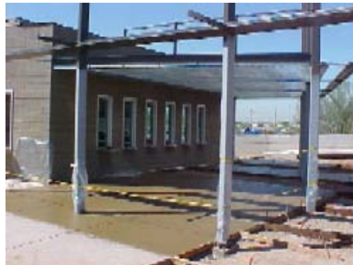
Ticket office and entry at Phoenix Muni

The completion of roofing on most of the project has allowed for significant progress to be made on the interior of the buildings. With the completion of the roofing, sheet rock is expected to start within days. During the past month the wall framing has been completed and exterior glazing wall installation begun.