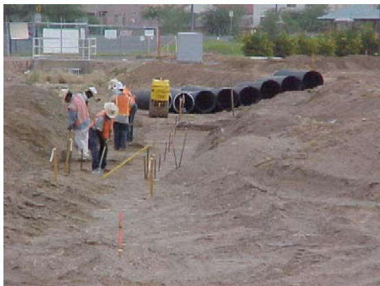
Workmen preparing subgrade in Avondale

The excavation and grading for the project's lake were completed the week of September 22 nd . Currently, grading for the parking lots, roads, playing fields and spectator berms between fields is underway.