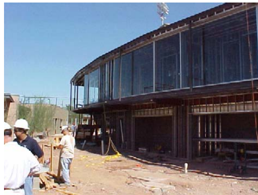
Concourse view of press box at Phoenix Muni

The dugouts are complete and awaiting installation of the benches. Concrete pours for the stadium concourses are underway with the area along the third base line mostly complete and work around the main entry and box office underway. The steel at the entry gates and ticket office canopy is complete and the larger trees for the main concourse landscaping have been installed.