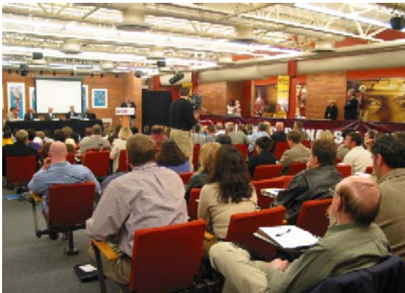
More than 150 stakeholders attended the Youth Sports Summit

DeFrantz is truly one of the world’s movers and shakers when it comes to the area of amateur athletics. Her keynote address described the organization and mission of the Amateur Athletic Foundation, a legacy group created after the 1984 Olympic Games in Los Angeles.