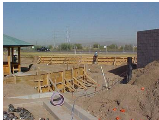
Retaining walls being cast in place near gazebo of the Avondale Youth Sports Complex.