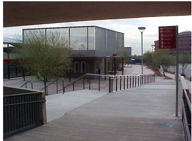
The newly refurbished stadium entrance and ticket office viewed from ramp leading to parking lot

Construction is complete on the $6.4 million upgrade of Phoenix Municipal Stadium, home to the Oakland Athletics. In return for the renovations, the Oakland A's have extended their lease by an additional 10 years, until the year 2014.