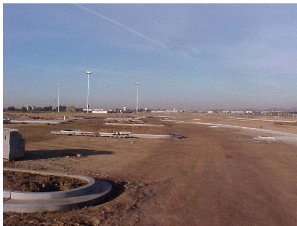
Parking lot curbing and gutters completed.

The project is scheduled for completion by the end of September.