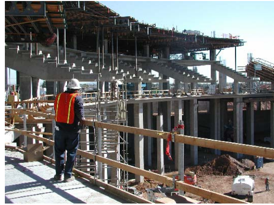
Workman standing on the main concourse level. Both the club and suite levels are visible in the background

• Financial Overview — Checker Auto 500 boosts hotel & car rental numbers.