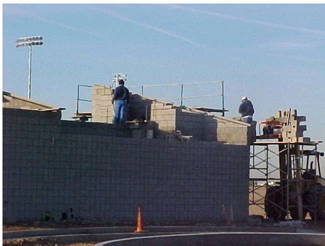
Masonry workers on the restroom and concession building

Work that will be continuing in February includes: