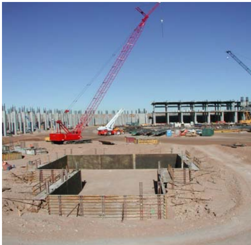
View of the southwest super column footer form looking north

Construction work in January on the stadium included preparing the footer forms for the two super columns located at the southern end of the facility. The four super columns will hold up the two main 700-foot steel roof trusses.