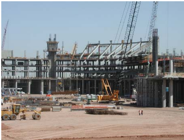
Upper bowl seating risers take shape in the northeast corner of the Cardinals Stadium.

As more elements of the stadium work have begun, the number of workers on site has risen to almost 500. One of the more visually significant areas of work begun is the framing for the exterior wall on the northeast corner of the project. Secondary support steel has been welded in place above the future ticket office/team store and will provide support for the unique Eisenman skin enclosure and protection for the office spaces that will be built inside. The white painted steel is the first contrasting color to the nearly 50,000 yards of grey concrete that have been placed to date.