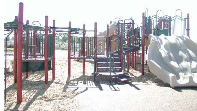
Avondale Youth Sports Complex Playground equipment

Work on major components of the Avondale Regional Youth Sports Complex have been taking place in June: