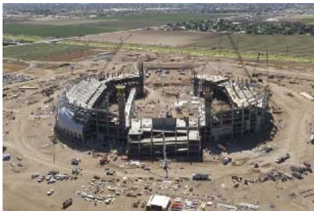
Aerial photo of Cardinals Stadium

The City previously met in two open workshops to discuss differing approaches to meet the City's obligation to provide the infrastructure for the site outside of the stadium itself. The Council indicated at that time its preference for an option in which the Authority would issue bonds for the infrastructure, to be paid for by the City's taxes and other revenues collected on the site.