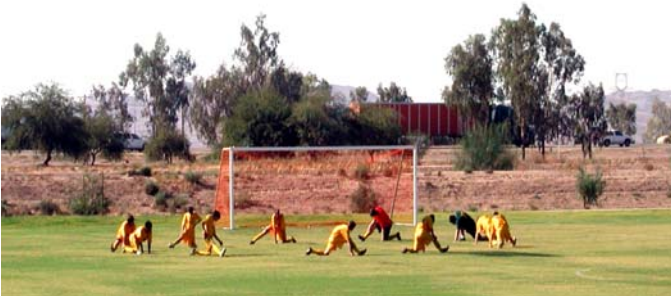
One of the Best — Avondale’s regional sports complex has enjoyed significant usage and picked up accolades during it’s first year of operation.

The facility was named the 2005 Outstanding Facility Award winner by the Arizona Parks and Recreation Association and a Merit award winner from Valley