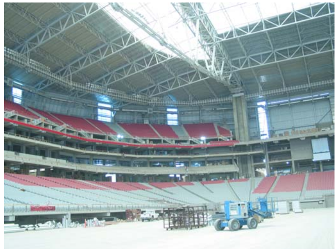
On the Floor with the Toy Expo — The Men's Luxury Toy Expo will be held on the 160,000 sq. ft. floor of the facility.

The new annual show will feature luxury products and services – targeted mainly to men -- including cars, recreational vehicles, game room essentials, sports memorabilia, and boats. The exposition is being held on the 160,000 square-foot floor of the stadium and it marks the first consumer expo where the general public will be able to walk on the floor of the new stadium.