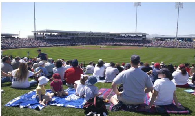
Day at the Ballpark — More than 1.1 million fans, like these seated on the Surprise Stadium's outfield berm, enjoyed spring training for the 2006 season.

The Giants played their 2006 season in the newly refurbished Scottsdale Giants Stadium while the Angels drew 96,315 fans to the newly refurbished Tempe Diablo Stadium.