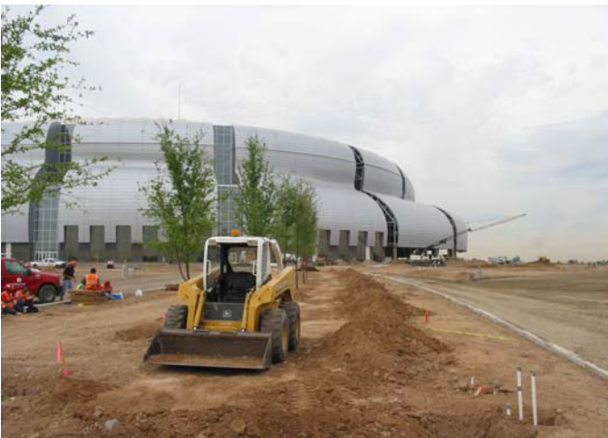
Landscaping and Paving — Workers install shade trees along the northeast pedestrian walkway.

Drivers along the Agua Fria Freeway saw dramatic changes around the stadium this month with significant progress made with paving and landscaping