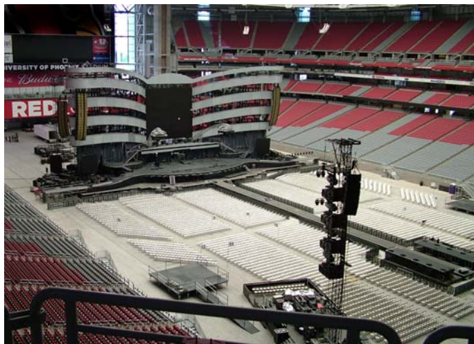
The Stones' stage set up on the stadium floor showing the stage extension (right) which allowed a portion of the stage to travel out into the audience. The stage itself weighs 300 tons.