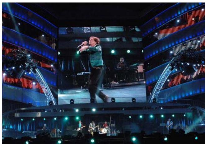
Mick Jagger appears on a huge 50' x 49' video screen built into the 9-story tall stage.

The Stones' massive 9-story tall stage featured an unexpected twist -- a section of the front detached and rolled out along a runway into the crowd giving fans in the north lower bowl a close-up and personal experience.