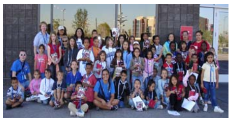
Local school kids touring stadium.