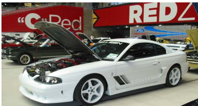
This Ford Mustang Saleen was part of what was billed as the largest indoor all Ford show in the world.

Exhibitors showed Muscles Cars, Street Rods,