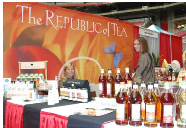
Vendors representing all aspects of food and beverage, equipment, and services for the hospitality industry exhibited on the floor of the stadium during the two-day expo.

The event included a tradeshow showcasing the latest in goods and services from suppliers in the hospitality industry and a conference component featuring educational seminars covering current industry topics and training sessions.