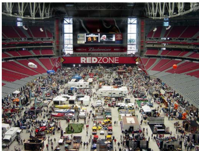
View of the Men's Luxury Toy Expo from the north end zone. This is just one of the stadium's grand opening season events which pushed August attendance to over 320,000.

The crowds visited the world-acclaimed stadium either as free guests for the public grand opening tours or as paying patrons for the Men's Luxury Toy Expo, the