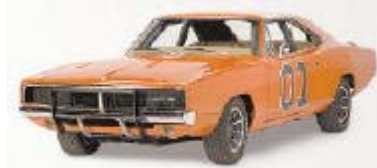
"General Lee" — Famous car from the TV show "The Dukes of Hazzard."

The 38th annual World of Wheels Autorama opened the stadium for the first time. The event is the state's largest and oldest annual indoor automotive show featuring 500 customized cars, trucks, vans, motorcycles and classic vehicles along with celebrity appearances.