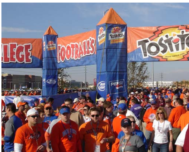
Broncos Fans Cheer — Throngs of Boise State fans flocked to the Tostitos Fiesta Bowl and witnessed their team defeat Oklahoma in one of the most exciting college bowl games of all time.

The Tostitos Fiesta Bowl was held Jan. 1 and the BCS National Championship was held on Jan. 8 in a format that had never been tried before. Credit the