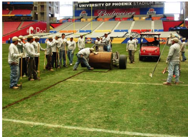
New Field Overlay — Crews install a brand new layer of turf for the BCS National Championship over the existing field used for the Tostitos Fiesta Bowl.

outstanding Fiesta Bowl organization and the flexibility of the University of Phoenix Stadium to pull off such a major national coup.