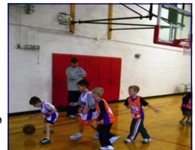
Over 300 kids a year from Tempe's YMCA youth sports program will benefit from AZSTA's quick grant program.