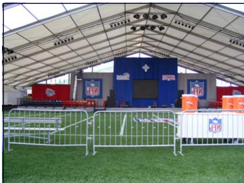
One of the many interactive aspects of the experience, four days before opening.

Proceeds from the gate were donated towards the NFL's charitable efforts in Arizona, the Youth Education Town (YET) Center.