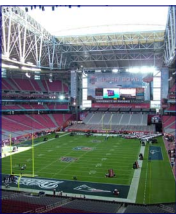
Game Day Credentials and ticketed patrons.

Game week began on Monday, January 28, at which time access to the Stadium was restricted to individuals with NFL-approved credentials or Licensor-approved (AZSTA) credentials working at the Stadium.