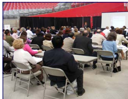
Jobing.com provided resume and job preparation classes throughout the career fair.

The first Jobing.com Career Expo at the stadium was held last year in January 2007 with 7,500 in attendance. The next Jobing.com career expo held at the stadium is set for Wednesday, May 14.