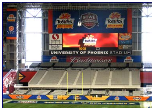
Extravaganza seating for the Fiesta Bowl added 7,830 additional seats for the game.

The Big East Conference Champion West Virginia's renowned speed and big-play offense stunned Big 12 Conference Titlist Oklahoma with six touchdowns, including three scores of 57 yards or longer and none shorter than 17 yards, in its 48-28 victory.