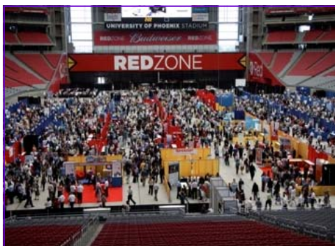
7,500 job seekers attended the event held on the field level.