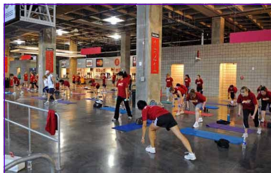
Boot campers utilize the main level of the stadium as well as other levels inside and outside of the building.

Adventure Boot Camp continues on for women and men of all fitness levels at the University of Phoenix Stadium. The four-week fitness program open to the public offers fitness instruction, nutritional counseling and motivational training.