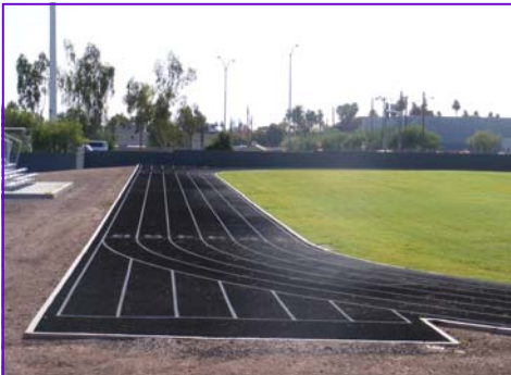
The rubberized track is one-sixth of a mile and has six lanes.

AZSTA's contribution allowed for the rubberized track surface that will provide a safe environment for the 550 elementary students, visiting students, parents and members of the community.