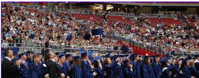
Centennial High School graduates celebrate their big day.

Peoria Unified School District held their graduations on May 22 and 23 in front of 29,525 guests. Four high schools from this district graduated on May 22, including: Cactus, Centennial, Peoria, and Sunrise Mountain High Schools. Ironwood and Raymond S. Kellis High Schools graduations were held the following day.