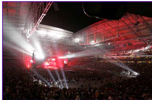
Tour organizers decided to open the roof during Chesney's set, the final performer of the night.

Country superstar Kenny Chesney hosted his "Poets and Pirates Tour" at the University of Phoenix Stadium on May 31. More than 40,000 fans headed into the Stadium that was cooled to 77 degrees, to hear country music artists Chesney, Keith Urban, Gary Allan and classic rocker Sammy Hagar.