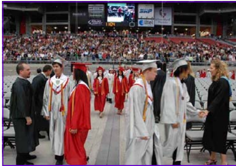
Ironwood High School graduates take their seats.

Both the Tolleson Union and Peoria Unified School Districts held high school graduations at the University of Phoenix Stadium.