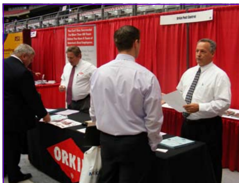
Job seekers are able to get face time with the companies which interest them.

The first Jobing.com Career Expo at the stadium was held last year in January 2007 with 7,500 in attendance. The next Jobing.com career expo held at the stadium is set for August 6.