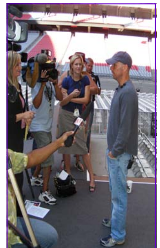
Chesney's press conference was held on the main stage.

At a press conference held prior to the show, Kenny Chesney expressed his excitement in being able to play at the NFL stadium that was home to Super Bowl XLII. "We did six NFL Stadiums last year and had a blast," Chesney said. "You get into a whole other kind of rhythm, and it's just the best vibe."