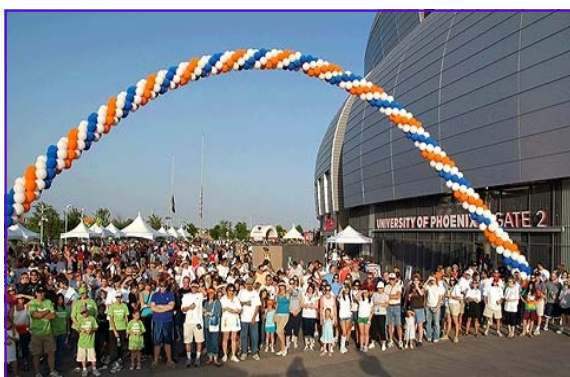
The event that raised over $210,000 featured 1,500 kids and adults.