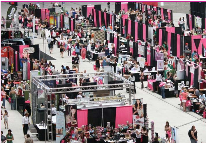
Hundred of vendors showcased their products on the field level of the Stadium.