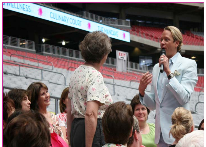
Celebrity Guest Carson Kressley gave the audience tips on how to better themselves.