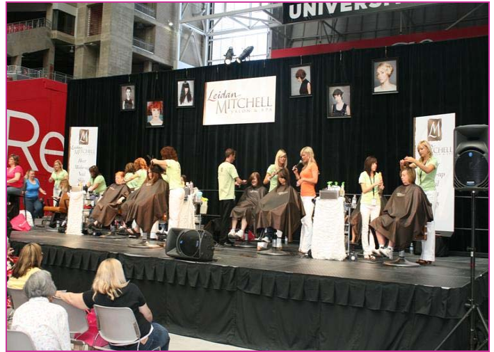
Guests were able to participate in the hair show.

Guests were able to sample all types of products, food and beverages, and were offered discount beauty treatments and were even able to participate in the live-hair show on the field level of the Stadium.