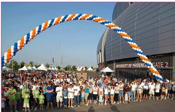
Participants in the 2009 walk raised in over $200,000 towards research for Crohn's and Colitis.